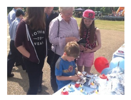
Armed Forces Day Letchworth