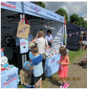
Armed Forces Day Letchworth