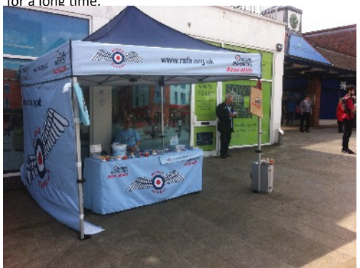
Nostalgia Day in Letchworth and we were there.