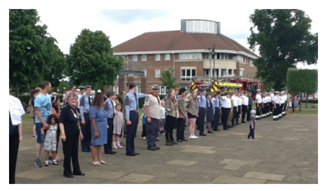
At Armed Forces Day Letchworth we involved the general public along with cadets to do a bit of Square Bashing